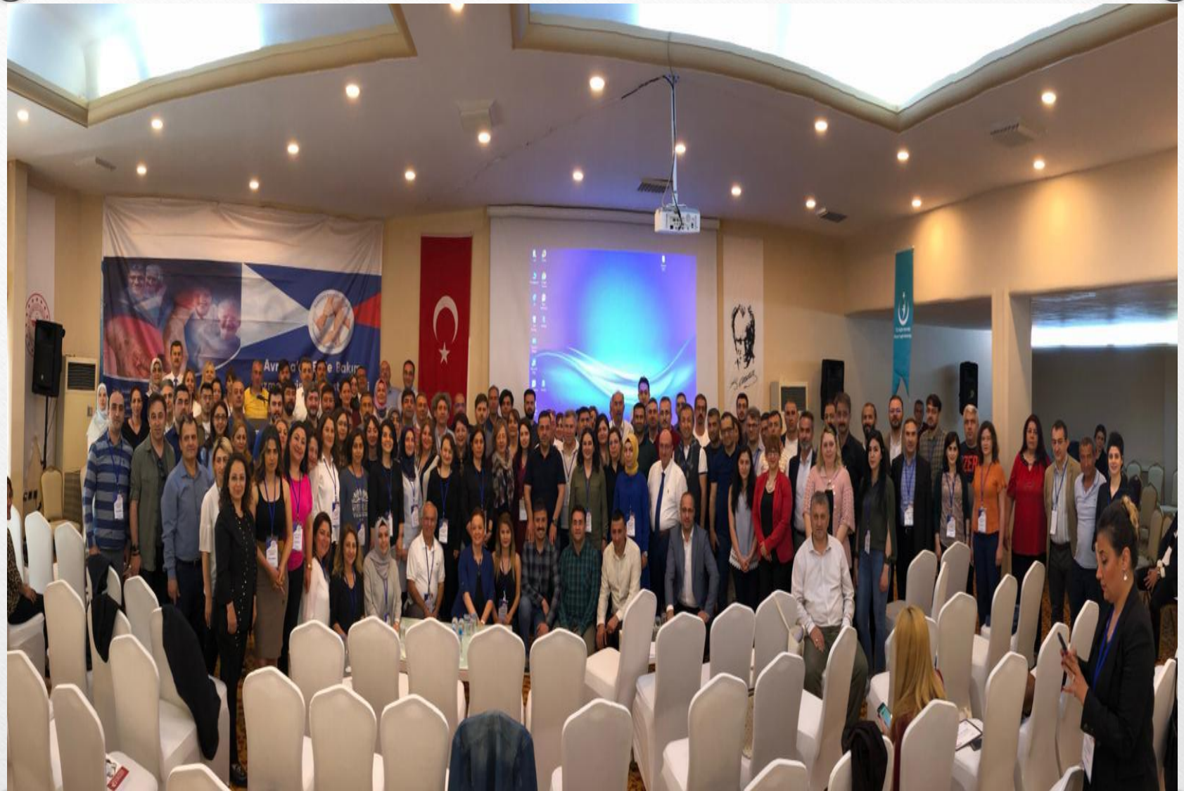
Improving the Quality of Homecare in Europe