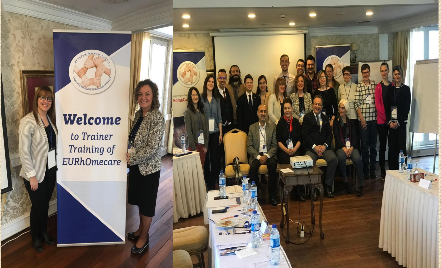
Improving the Quality of Homecare in Europe