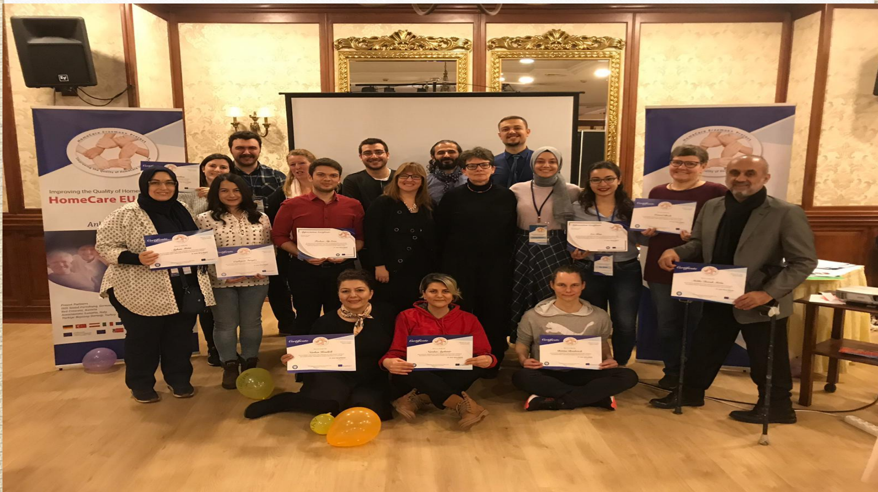
Improving the Quality of Homecare in Europe