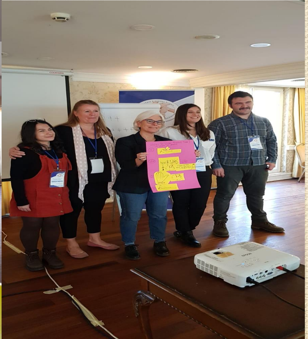
Improving the Quality of Homecare in Europe