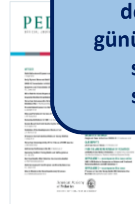
Volume 1, Issue 5 May 1948 Pages 581-723