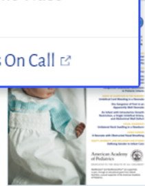
Volume 24, Issue 3