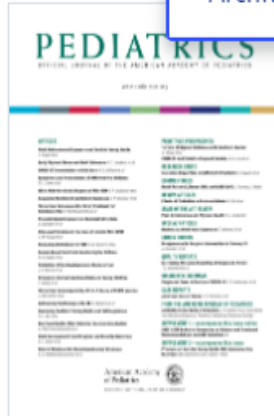
Volume 1, Issue 2 February 1948 Pages 145-306