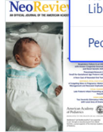
Volume 24, Issue 2