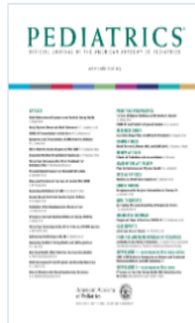
Volume 1, Issue 2 February 1948 Pages 145-306