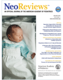
Volume 24, Issue 1