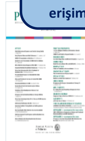
Volume 1, Issue 5 May 1948 Pages 581-723