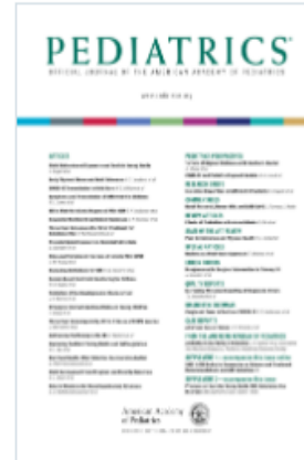
Volume 1, Issue 4 April 1948 Pages 437-580