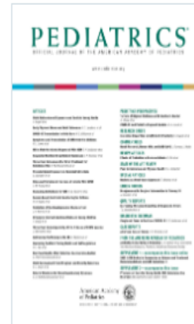
Volume 1, Issue 4 April 1948 Pages 437-580